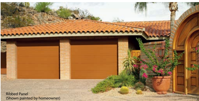
Ribbed Panel (Shown painted by homeowner)