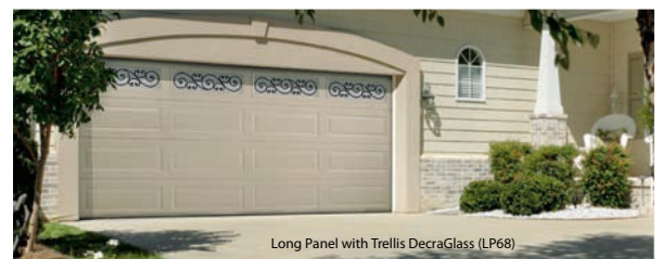
Long Panel with Trellis DecraGlass (LP68)