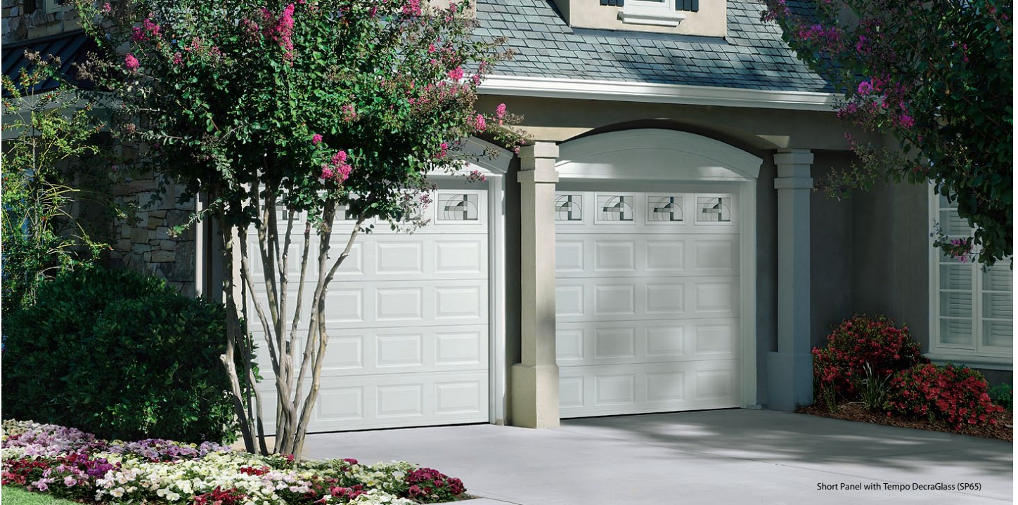
Short Panel with Tempo DecraGlass (SP65)

Tradition never goes out of style. Choose from four different panel designs to create the steel garage door you always wanted. The Heritage Collection of traditional designs provides a low-maintenance heavy gauge steel door. Amarr's section interfaces are designed to reduce the risk of serious finger and hand injuries. The Heritage Collection. Great looks for years to come.