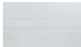
RIBBED PANEL WITH STUCCO EMBOSSMENT 2720 is Flush Panel with stucco embossment.