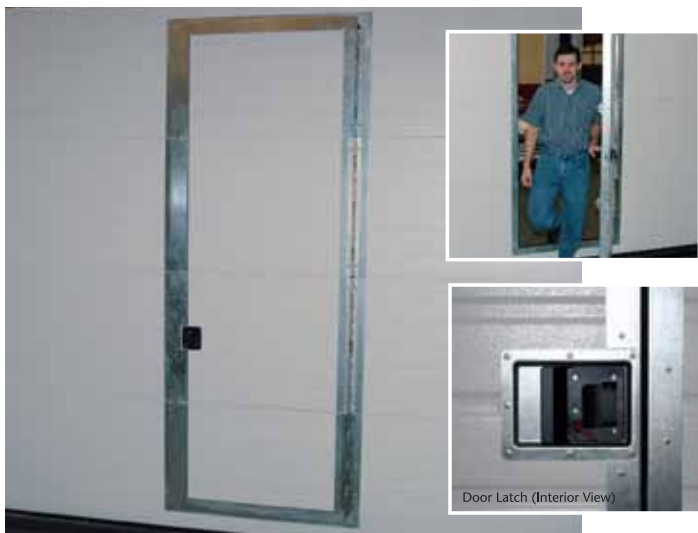
Available for Model 2700 only in door sizes up to 16'2" wide x 16' tall. Wind Load option not available.