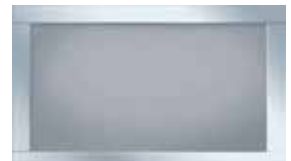
OPTIONAL FULL-VIEW PANEL Clear Anodized Aluminum, White Powder Coat, or Custom Powder Coat colors. Not available for Model 1350.