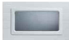
24" X 12" INSULATED GLASS