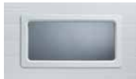
24" X 12" INSULATED GLASS