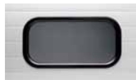
26" x 13" DOUBLE INSULATED ACRYLIC WINDOWS WITH BLACK FRAME