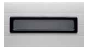
24" x 6" DOUBLE INSULATED ACRYLIC WINDOWS WITH BLACK FRAME